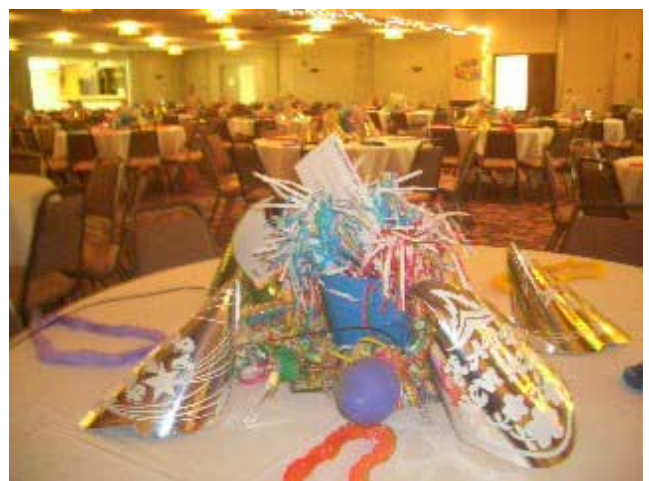
Decorated and ready for the Holiday Bash

Meetings take place the first Sunday of each month. We meet at All That Jazz in the Parkway Plaza from 4 to 6 pm. Everybody is welcome to come and take part.