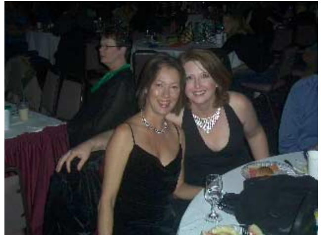
Looking good at the Holiday Bash!